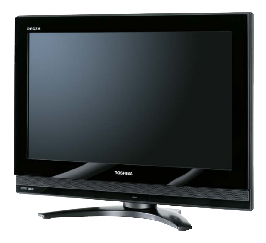
PixelPure 3G™ - PixelPure 3G™ has high 14-bit internal digital video processing for accurate 12-bit output, and is therefore capable of producing an amazing 4,096 levels of gradation for a smooth, natural picture without image banding.

Superior processing creates a superior picture, and REGZA LCD TVs with PixelPure 3G set themselves apart with incredibly deep, sharp, and natural images, for home theater beyond your imagination.